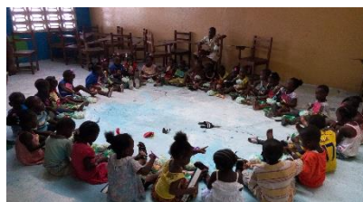
Children in circle