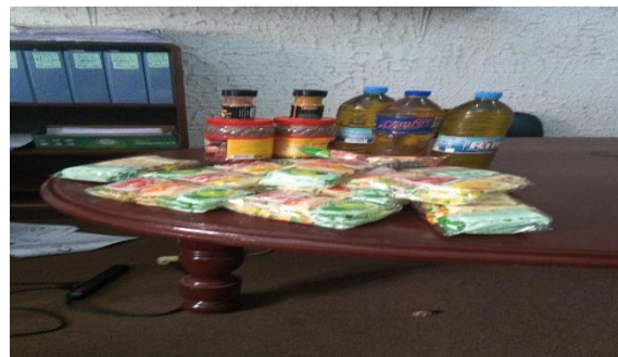
Materials for Home Visitors