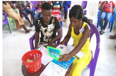
Parents Role Play Activities