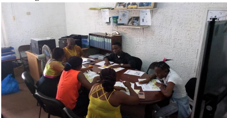
Year Two home visitors during the regular Friday training