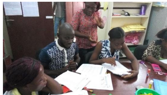
Year One home visitors during regular Friday training