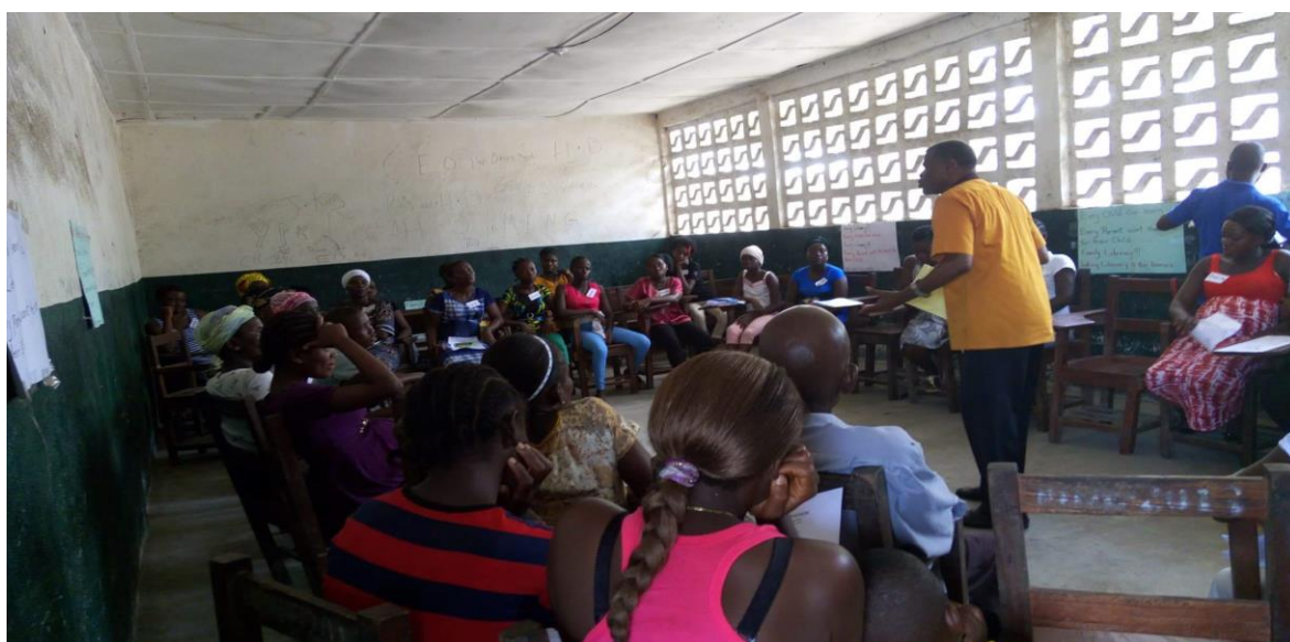
Mr. Weah encouraging parents to maximize the use of the program for their children future