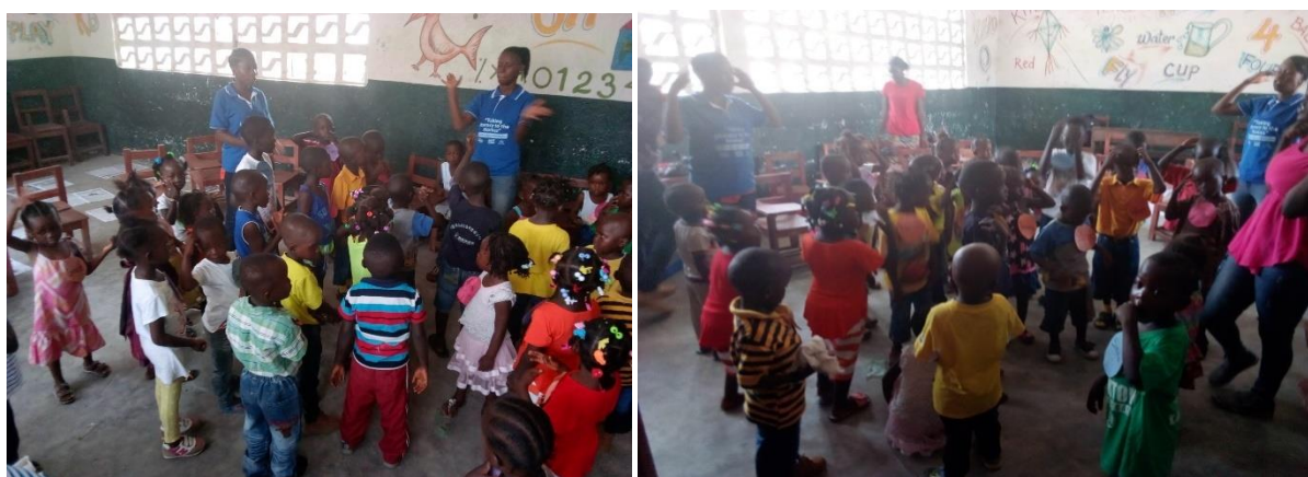
Home visitors working with children during group meeting