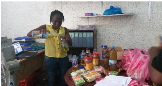
Sorting materials for home visitors