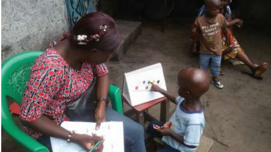
FLI Coordinator administering the Bracken achievement test at the end of FLI's pilot Year One to a young FLI participant.

The evaluation included recommendations for future years, including adaptation of the written materials to reflect the Liberian culture, gathering more socio-economic data on the family to see correlations between certain characteristics and program success (as well as referrals for interventions if needed), and developing or locating literacy training for caretakers who have a harder time reading the materials to their children but are enthusiastic to improve their own skills.