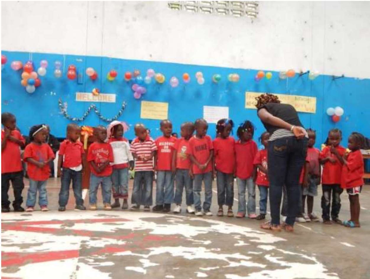
Children celebrating completion of Year One of the pilot FOL-WE CARE-HIPPY