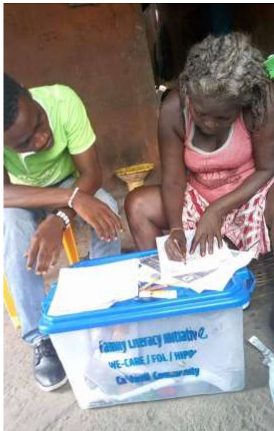
FLI 2016: WE-CARE Home Visitor working with mother during weekly home visit to prepare lessons for child.

The FOL Health Committee has worked closely with its counterpart Health Team in Liberia, who are MSN Ed graduates at the Mother Patern College of Health Sciences, toward identification of ways to help improve the knowledge base and competency of the faculty at the Liberian schools of nursing and midwifery. A needs assessment survey was developed and modified after piloting it with a group of instructors. It will be administered in early 2017 and a proposal developed based on analysis of results and focus groups. Please read more about this project on page 17.