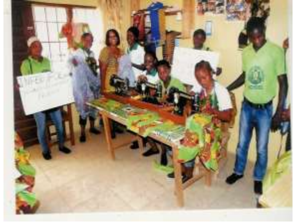
Left: Graduates of the INFED program thanking FOL for its support. Right: With sewing machines purchased through FOL grant.

At the end of 2016, two additional grants were awarded. They will report achievements in 2017.