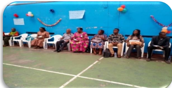
Cross sessions of Guests