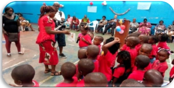
Duazon children demonstrate reading skills