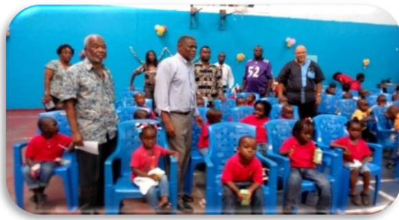
WE-CARE Board along with ED & FLI children