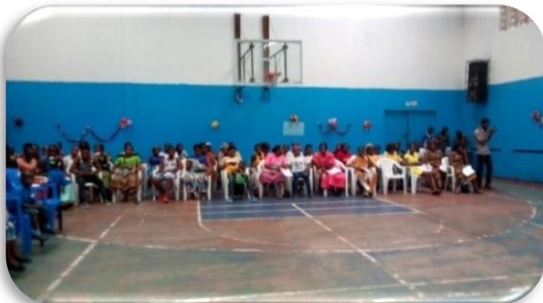
Cross session of parents