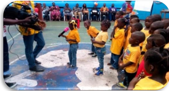
Caldwell children demonstrate phonetic skills